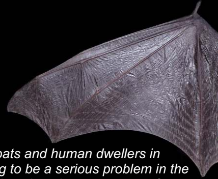
Noctule bat (Nyctalus noctula) in emergency care

The conflicts between bats and human dwellers in prefab houses are going to be a serious problem in the near future. During the last decade, occurrence of noctules (partly also pipistrelles and parti-coloured bats) considerably increased in prefab settlements in towns (especially in autumn and winter). Bats (sometimes in hundreds) occupy attics and crevices between panels. Noise disturbance, the presence of droppings and individual bats entering the living area causes problems for the occupants. Structure of prefab buildings (ventilation shafts) can be also a dangerous trap for bats. Also bats may be killed during reconstruction works (e.g. thermal insulation of walls). Several cases were successfully resolved through timing of works to minimise disturbance, translocation or evacuation of bats, and emergency care of exhausted bats but new cases are still appearing. A search for the best solution is still in progress.